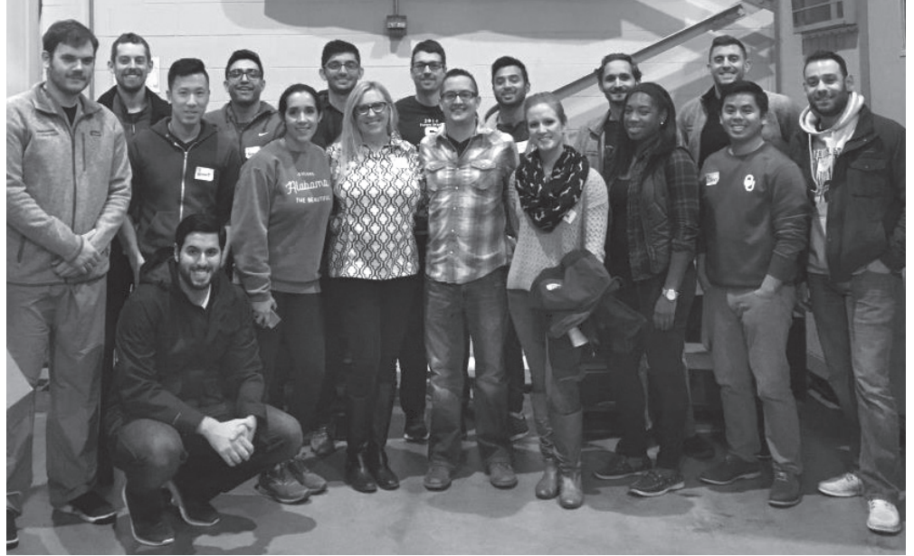
SJMOH ER residents who rolled up their sleeves at Gleaners Food Bank

In December, the St. John Macomb-Oakland Emergency Medicine Residency Program staff donated their time to the local food bank to give back to the community. During their visit, they moved 18,064 pounds of food which equates to 14,451 meals! In addition, the group donated funds to purchase 396 gallons of milk for families in need.